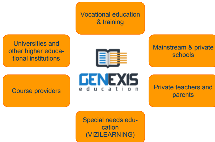
Fig.1 GenExis user groups

For course providers – GENEXIS is an easy way to make any course available online and that means available for a lot more students than before. Time and place will not be an issue anymore because there will be one place for all the training, testing and consulting that's needed for successful completion of study course.